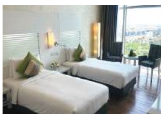
Doha - Prima Deluxe Room

At Holiday Villa Doha , the Deluxe and Executive rooms have been transformed with vibrant, modern designs that seamlessly blend style with functionality, ensuring a more comfortable and sophisticated guest experience. These newly upgraded spaces feature contemporary furnishings, enhanced lighting, and thoughtfully curated amenities, offering guests a perfect balance of comfort and elegance.