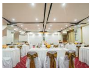
Bali - Pandawa Meeting Room

Meanwhile, Holiday Villa Bali has undergone a full renovation and refurbishment, infusing the hotel with renewed charm and upgraded facilities. These enhancements reflect Holiday Villa's commitment to providing exceptional hospitality, ensuring that each stay is memorable and aligned with the latest standards of comfort and style.