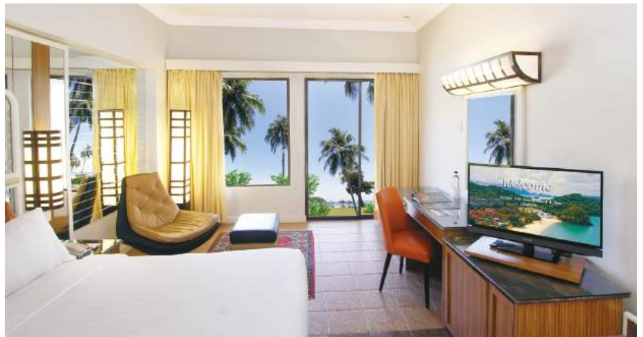
Holiday Villa Langkawi