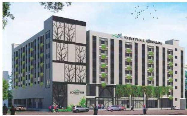
Holiday Villa Hotel Kuala Terengganu