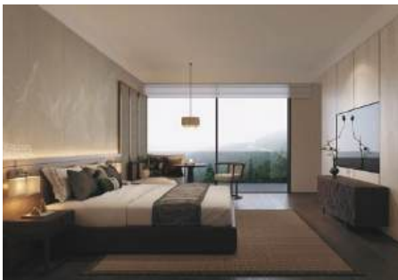
Holiday Villa Spring Resort Nanyue Hengyang