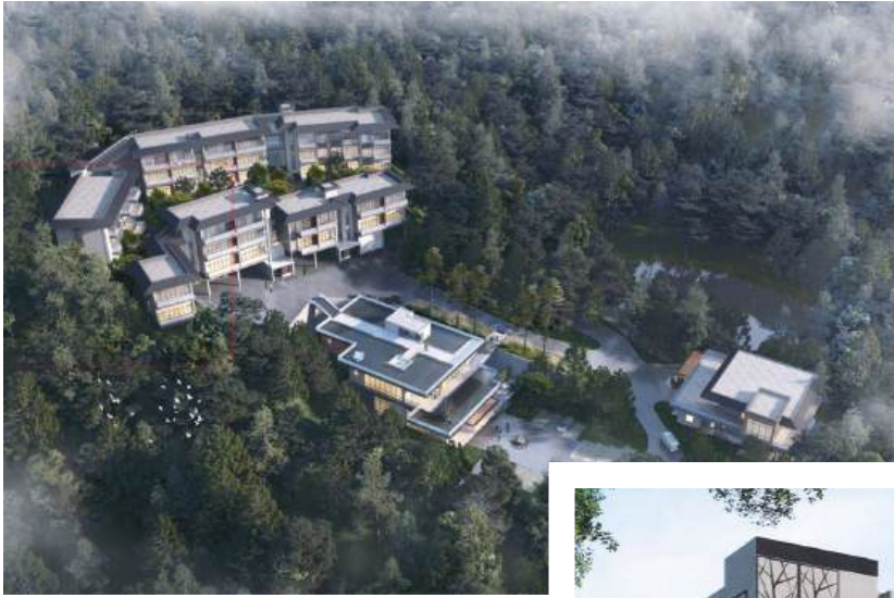
Holiday Villa Spring Resort & Villas Nanyue, Hengyang, Hunan, P.R.C