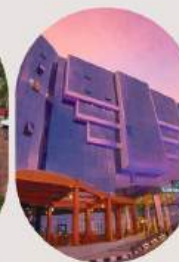
Hail, S. Arabia