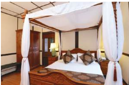
ViVilla Pool Villa, Cherating