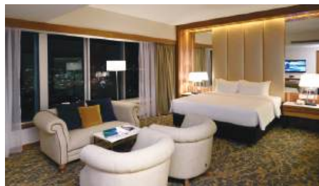
Holiday Villa Johor Bahru