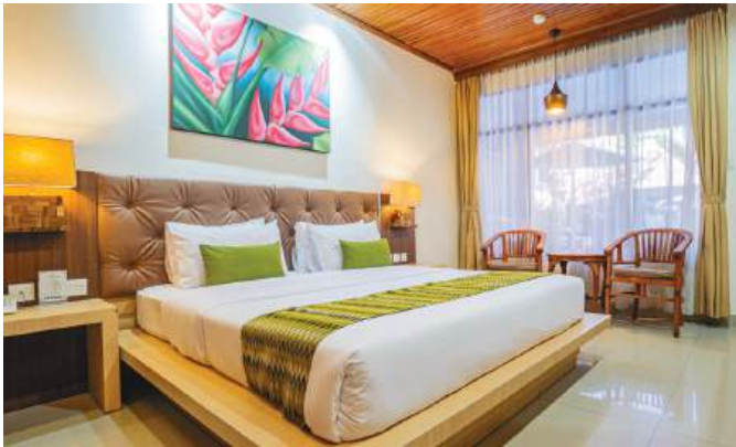
Holiday Villa Kuta, Bali