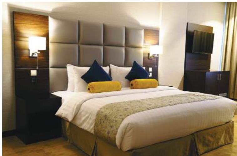
Holiday Villa Hail, Saudi Arabia