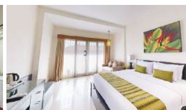
Bali - New Deluxe Studio