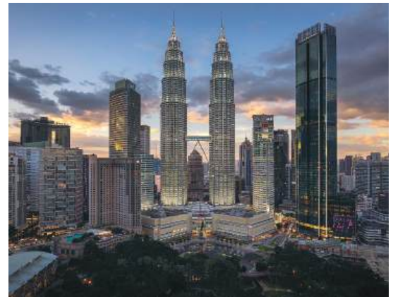
Holiday Villa Hotels & Residence Kuala Lumpur City Centre