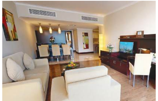
Holiday Villa Doha