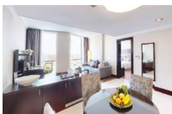
Doha - Prima Executive Room

Meanwhile, Holiday Villa Bali has undergone a full renovation and refurbishment, infusing the hotel with renewed charm and upgraded facilities. These enhancements reflect Holiday Villa's commitment to providing exceptional hospitality, ensuring that each stay is memorable and aligned with the latest standards of comfort and style.